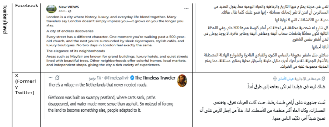
Figure 3. Screenshots of Tourism/Travel Posts and Tweets