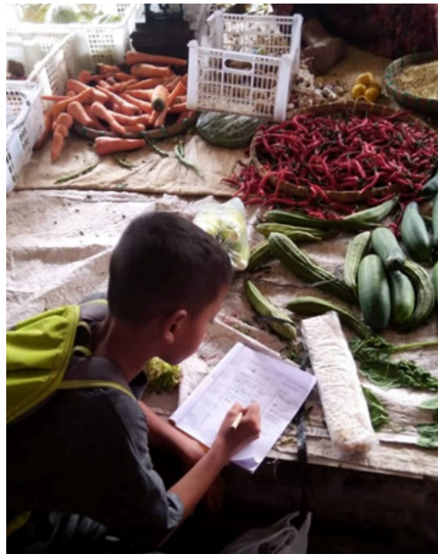
Figure 6 Students Shop at Traditional Markets

In mapping the physical and motor skills of students at the Bengawan Solo Natural School, edureneur and leadership activities are carried out to create children's character and develop their cognitive abilities. Every Thursday an interesting activity is carried out in the form of buying and selling which is carried out by the children of the Bengawan Solo Nature School. Students will prepare independently, starting from buying materials, making goods to be sold, selling, to sharing the results obtained with their friends. From this activity it is expected to be able to map the potential of students in aspects of courage, business spirit, how to calculate profits, and how students carry out a fair distribution of results.