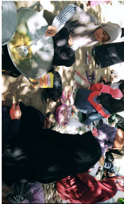
Figure 4 “Work with Parent” Program

Learning Indonesian procedural text materials is also integrated with the “Work with Parent” program which is implemented to further strengthen the relationship between children and their parents. Students are directly accompanied by their parents to implement the procedure text on how to cook various processed mutton. Processed goat meat will be cooked with satai, tengkleng and tongseng which are local specialties. The processed food will be eaten together and some will be distributed to the local community.