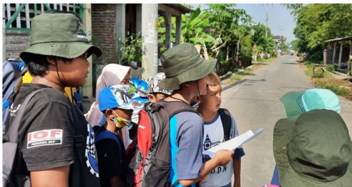
Figure 5 Learning Indonesian to Read Plans

Learning Indonesian procedural text materials is also integrated with the “Work with Parent” program which is implemented to further strengthen the relationship between children and their parents. Students are directly accompanied by their parents to implement the procedure text on how to cook various processed mutton. Processed goat meat will be cooked with satai, tengkleng and tongseng which are local specialties. The processed food will be eaten together and some will be distributed to the local community.