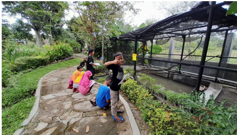
Figure 3 Poetry Writing Learning

Mapping intelligence (intelligence) in learning Indonesian at the Bengawan Solo natural school is carried out by understanding and presenting factual knowledge using clear, systematic and logical language, in aesthetic works, in movements that reflect healthy children, and in actions that reflect behavior of students who have noble character when playing and learning in nature.