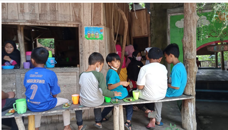
Figure 7 Edupreneur and leadership activities

The result of implementing these activities is being able to build an independent mentality of students by being accustomed to getting something by working hard and lawfully. The method used is to learn to do business both independently, in groups, and learn directly from various professions by visiting or inviting to school. It is hoped that this will build a generational mentality that appreciates various professions and their benefits. In addition, this activity becomes an activity that can develop physical and motor activities in each student.